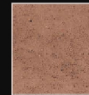
OX - 30