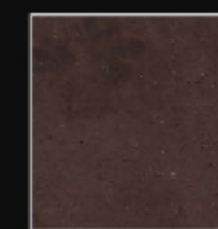
OX - 34