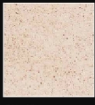
OX - 28