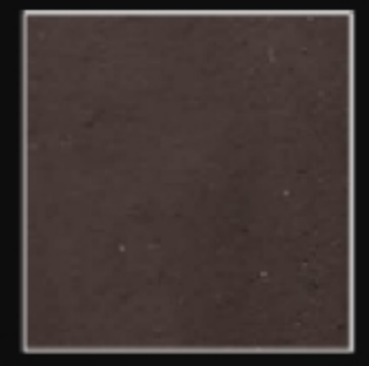
OX - 33