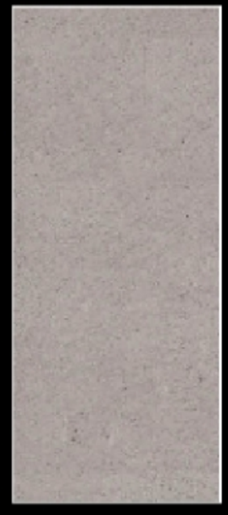
OX - 22 SCUDO FPOXY SATIN