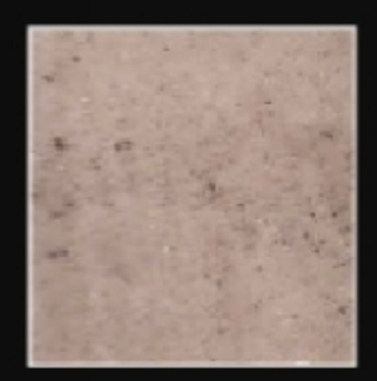
OX - 29