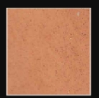
OX - 49