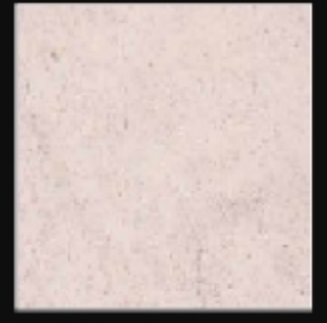
OX - 50