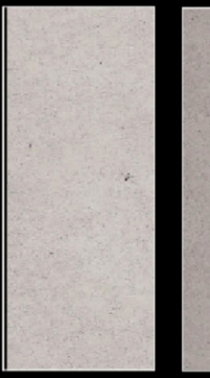
OX - 21 SCHOO FPOXY MAIT