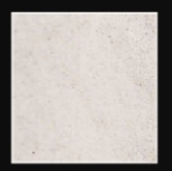
OX - 25