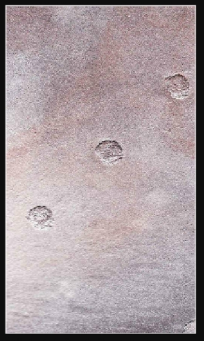
OX 23 + Fisiativo tre stelle + Structura: HI-TECH Alluminio/Rame