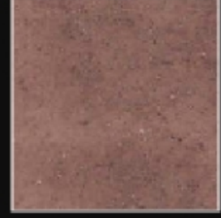
OX - 38