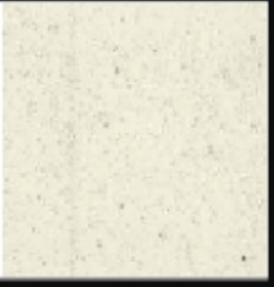
OX - 48