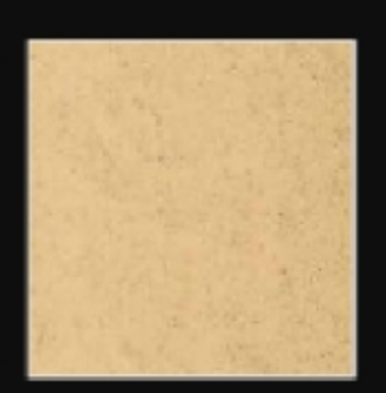
OX - 45