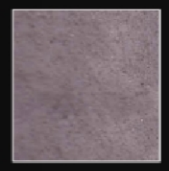
OX - 37