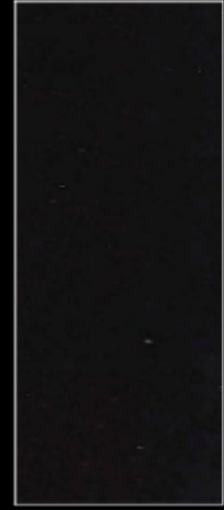
OX - 23 SCUDO FEOXY HICH CLOSS