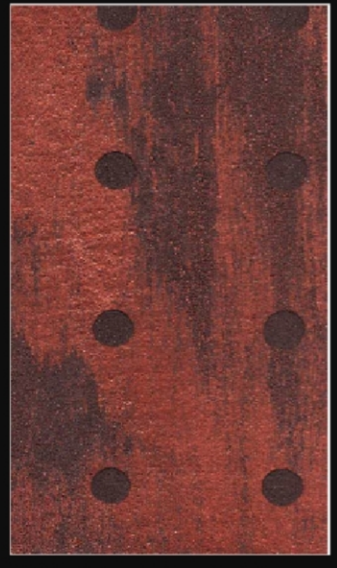
OXYDA BASE + Structural HI-TECH Rame + Rust Paint